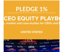
The CEO Equity Playbook