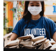
Pledge 1% Humanitarian Relief Series: Resource Hub