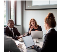
Three Starting Points To Effective Social Impact